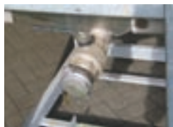
HST version 3" ball valve