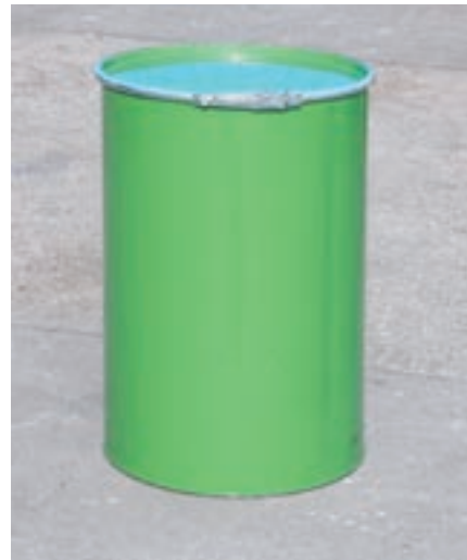
216.5-l / 200-kg lid-type drum made of sheet steel without beads inside untreated outside painted green without inner PE sack or with inner PE sack sheet thickness of 0.75 mm for shell 1 mm for base and lid 571.5 x 890 mm