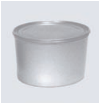
2.5-kg vacuum-sealed can 190 x 126 mm deep-drawn two-piece bright

We would like to use this Technical Information sheet to give you, our customers, an overview of the different containers and their sizes in which you can purchase printing inks.