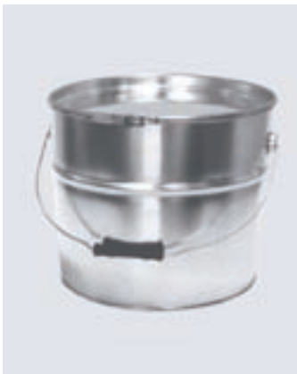
10-kg drum with wire handle conical tin plate 280 x 265 x 235 mm