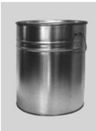
25-kg drum conical tin plate 328 x 312 x 390 mm