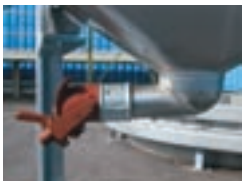
MHM version R3" perfection cock